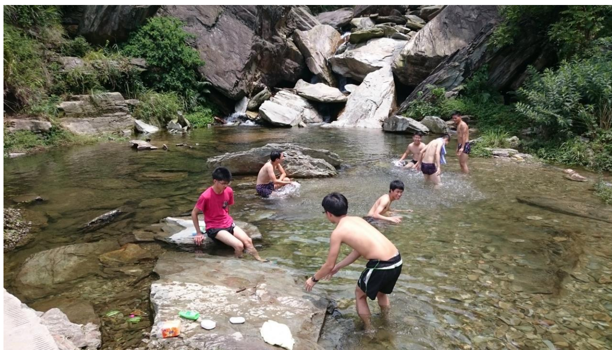
Students having shower near Xiali