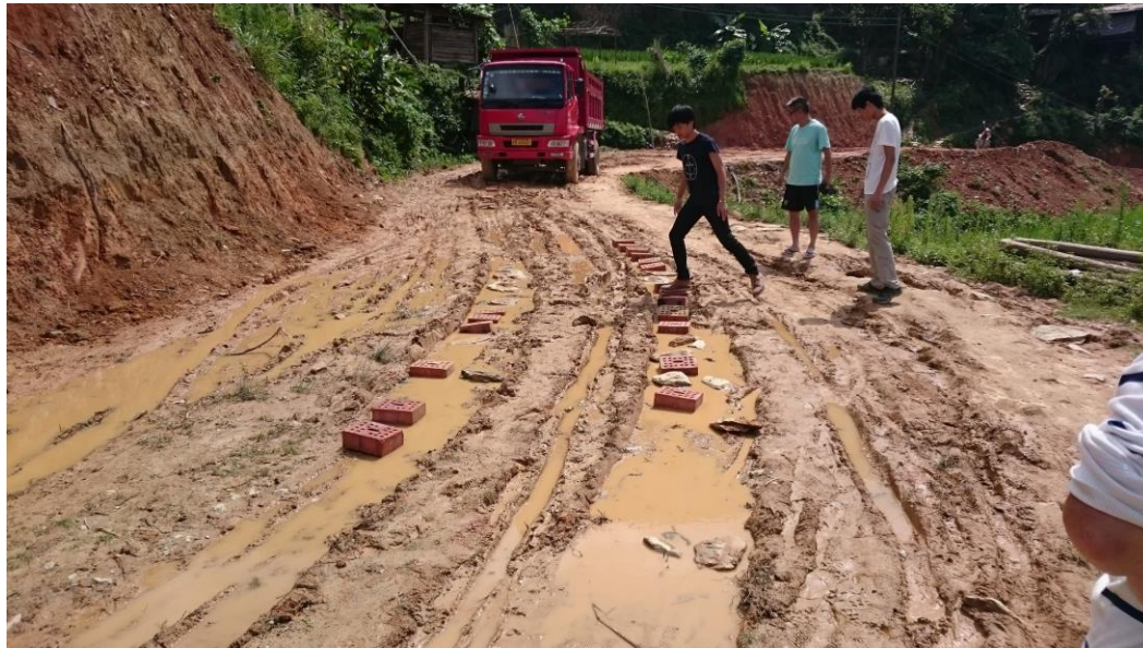
Muddy driveway near Hongdeng

As the project site was situated in areas around five hours away from the city with poor road access, accommodation and washing facilities were rather primitive when it compared to other constructions carried out by the Project Mingde in the previous years. Though a new teaching block made of concrete has been well erected to cater our accommodation needs, living in this primitive housing for three weeks still remained a great challenges for us. Throughout the working days in Hongdeng, we have to sleep on concrete floors relying on mats and blankets only, staying in three teaching rooms filled with mosquitoes and insects throughout the nights.