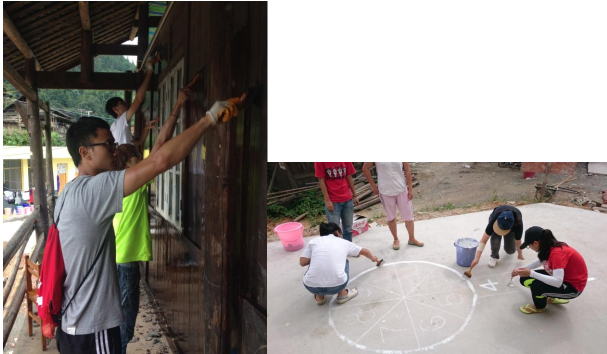
Students painting outer wall and hopscotch respectively

Based on our design proposal of repair and improvement work, we had two meetings with students from Guang Xi university and the Contractor to discuss the viability of those proposed work. After the discussion, we decided that some work can be done and some work are banned. The work to be done are regulating the building, ground pavement, painting of supports and outer wall of the building, drainage system.