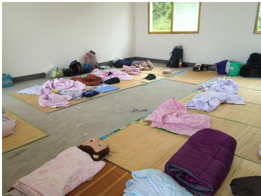
Newly-constructed rooms for accommodation