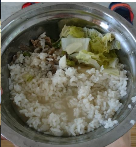
Typical meals in Hongdeng