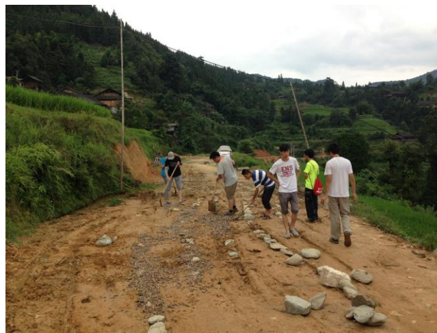
Road pavement using aggregate and stone