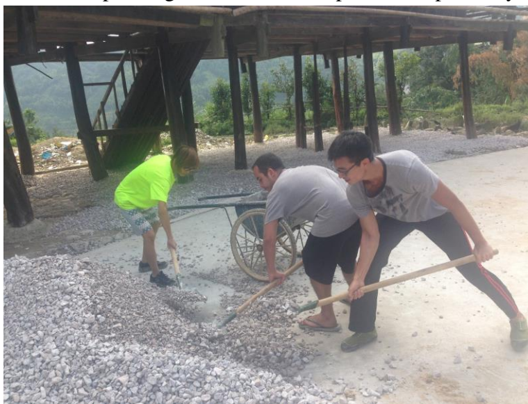
Spreading aggregates for concrete foundation