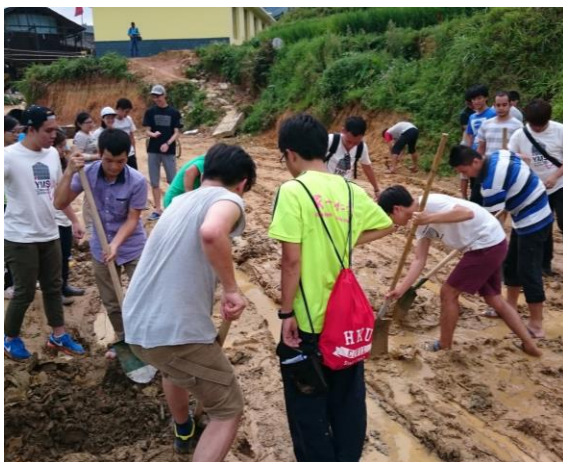
Creating channel to drain away water

Due to heavy rain and the humid weather in Hongdeng, the road is unsuitable for large vehicles to pass through especially for the section near the Hongdeng primary school. As a result, we need to improve the condition of the road.